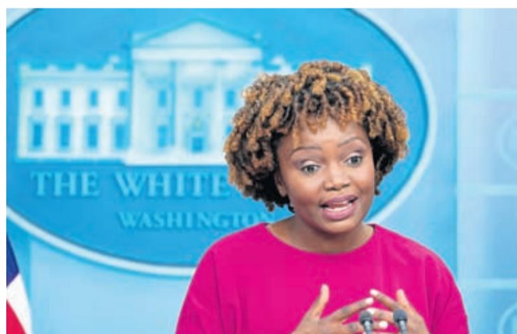
White House press secretary Karine Jean-Pierre speaks during the daily briefing at the White House in Washington, Monday, Dec. 12, 2022.

In southern Minnesota, winds gusting up to 50 mph (80 kph) had reduced visibility and in the Twin Cities metro area, sleet and gravel mixed with rain on the roads. □